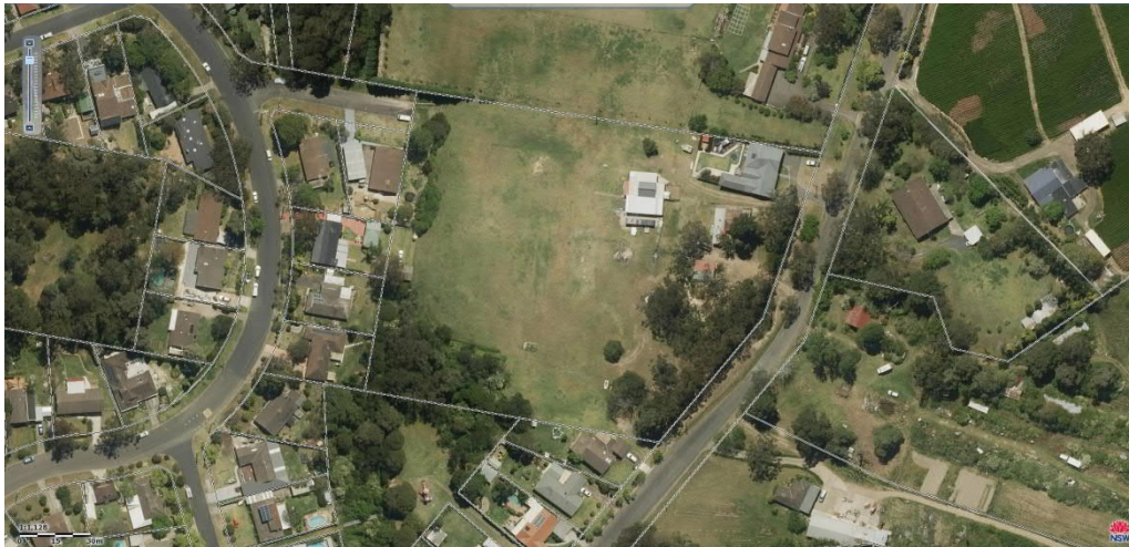
Figure 3. Site context – Aerial Photo.

The site is well suited to provide Aged Care accommodation under the State Environmental Planning Policy: Housing for Seniors and People with a Disability legislation as it is adjacent to existing established residential development and close to existing shops and services. The large size of the site provides an excellent opportunity to provide more than just a handful of independent living villas, and the topography of the area is ideal for easy access throughout.