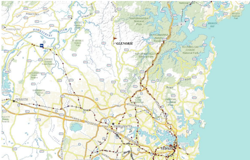
Figure 1. Broad Context. SIX Maps

The greater metropolis of Sydney is dotted with Aged Care facilities of many and varied sizes, though is still required to provide more to cater for the Baby Boomer generation who is entering their retirement years. This proposal presents an attractive offering for a lifestyle driven ageing population in a relaxing semi-rural location which is well resources with existing amenities.